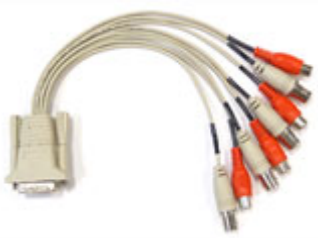
4 cam video cable