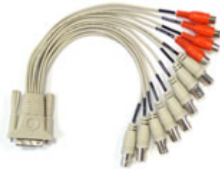
8 cam video cable